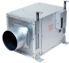
Panasonic Whisperline Fans