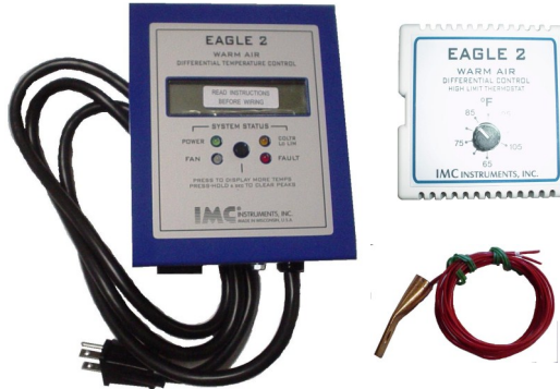
Controller, includes thermostat, 1 sensor with long high-temperature leads