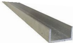
C-channel aluminum racking