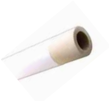
High temperature duct insulation