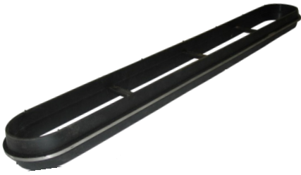
EPDM Array Interconnect Set (2 receivers, 1 stint): $115