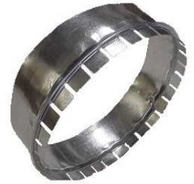
Ducting starter collar