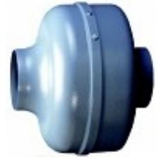
CFM In-line Fan with mounting brackets. AC Power