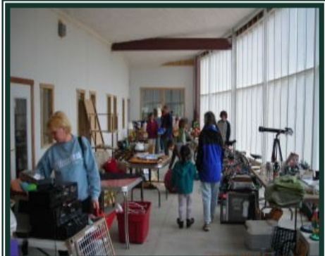
Community Members looking at items in the garage sale. This is the greenhouse space in our new building.

chocolate and good conversation was plentiful! The event's success could