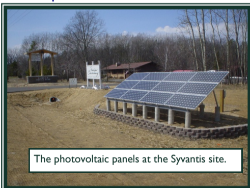
The photovoltaic panels at the Syvantis site.

Last September RREAL installed photovoltaic panels at the Fairview Office Park in Brainerd for Syvantis Technologies. This 2.2 kilowatt system provides approximately one quarter of the electricity needs for the 13,000 square feet building. The panels are highly visible off of Highway 210 in Baxter. This location is ideal providing RREAL another opportunity to show what a strong and viable alternative solar power is to traditional energy sources.