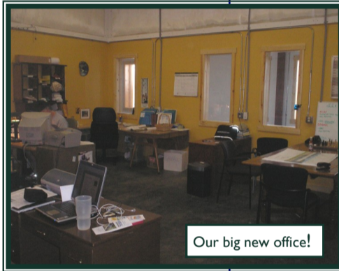
Our big new office!

HUG's mission is to explore and develop sustainable building techniques and systems. RREAL both supports and practices this mission ourselves— what a great fit! The campus is full of innovative and sustainable projects like different wind turbines, straw bale buildings, a green roof, permaculture, low energy and water use buildings and environmentally friendly art. Continued on Page 2. See Move.