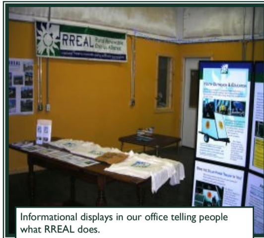
Informational displays in our office telling people what RREAL does.

volunteers, thank you so much to all those that helped. The event's success could not have happened with out all of our volunteers, thank you so much to all those that helped. Over the course of the day, there was between five and six hundred people out at the HUG campus. People came with questions and interest in what RREAL does. We were simply blown away by the community outpouring. We are so grateful and happy to see so much interest in our organization. Thank you to all who donated to these events. Combined the garage sale and silent auction raised over $4000, which will help RREAL continue to grow as an organization.